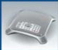
IP Conferencing Phone