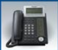
Business Telephone System