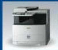
A4 Color Multifunction