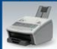
Plain Paper Laser Fax